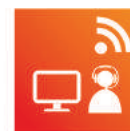
Communication & Management